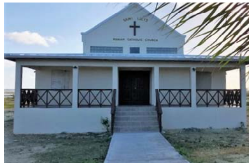
St. Lucy's, South Caicos.