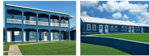
Holy Family Academy, Providenciales.