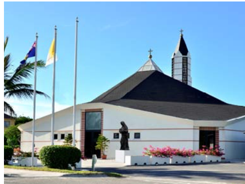
Holy Cross, Grand Turk.